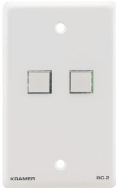
▲ US version