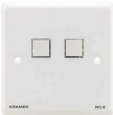
▲ European version