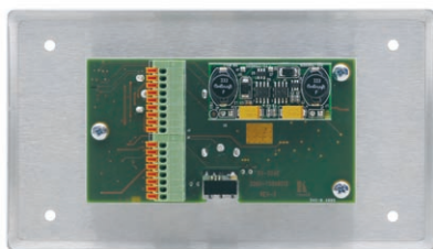
▲ European version

The SV-304 is a wall plate for component video, S/PDIF audio and IR signals. The unit is part of the SummitView™ media room solution and converts the signals to a twisted pair signal to connect to the SV-551 processor/controller.