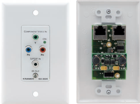
▲ US version