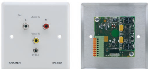
▲ European version

The SV-302 is a wall plate for composite video, stereo audio and IR signals. The unit is part of the SummitView™ media room solution and converts the signals to a twisted pair signal to connect to the SV-551/SV-552 processor/controller.