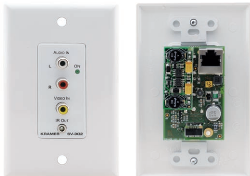
▲ US version