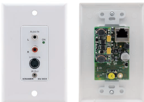
▲ US version