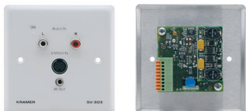
▲ European version

The SV-303 is a wall plate for s-Video (Y/C), stereo audio and IR signals. The unit is part of the SummitView™ media room solution and converts the signals to a twisted pair signal to connect to the SV-551 processor/controller.