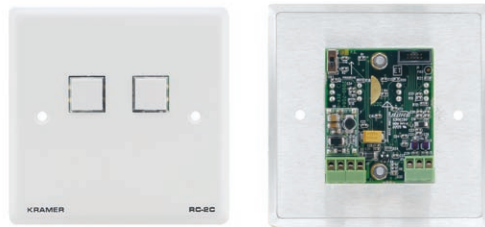
▲ European version

The RC-2C is a 2-button controller that sends a series of RS-232 or IR commands with the push of a button. It operates serial or IR-controlled devices such as projectors, displays, and switches.