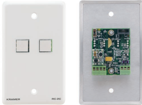
▲ US version