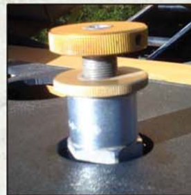
Oscillation control valve - select the exact amount of screen oscillation for varying conditions