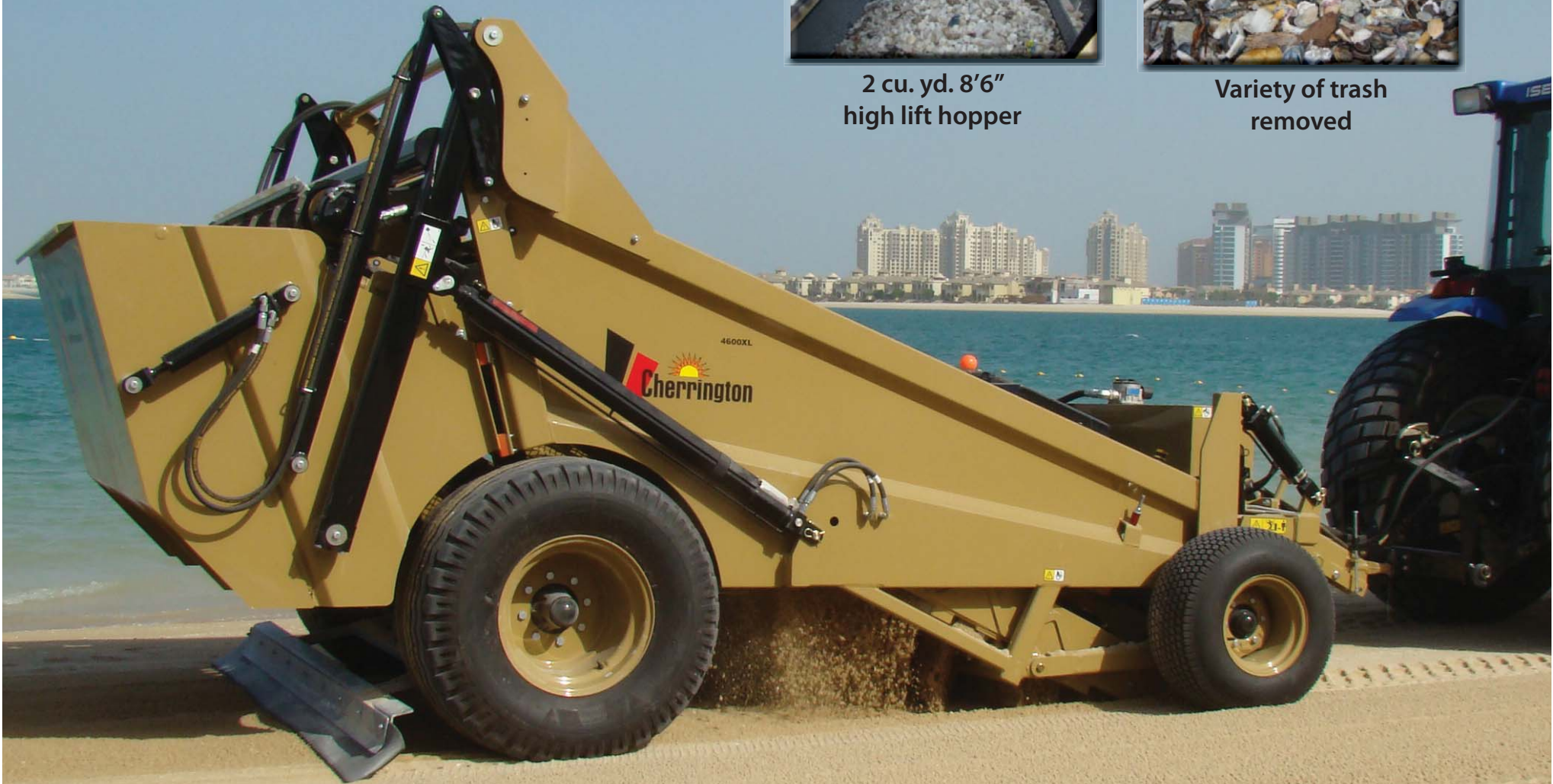
Cherrington Model 4600XL