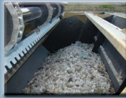
2 cu. yd. 8'6" high lift hopper