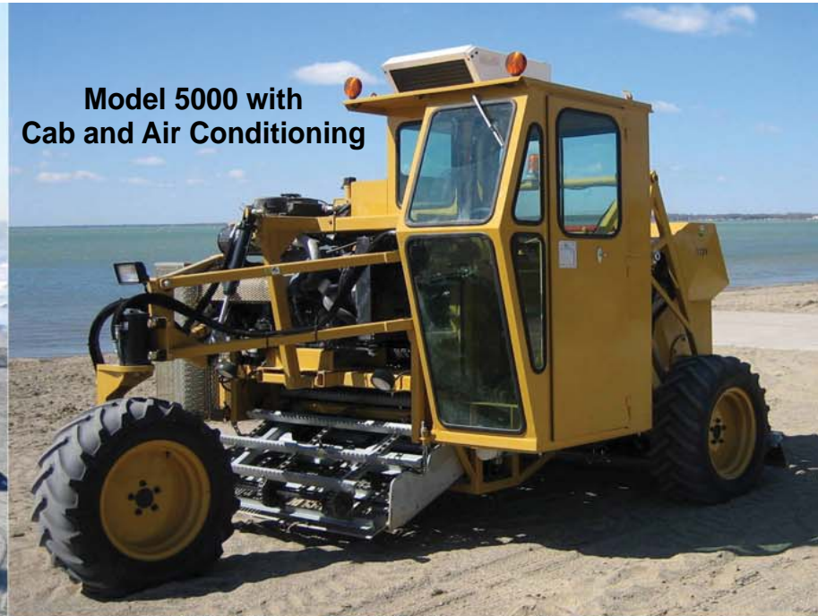
Model 5000 with Cab and Air Conditioning