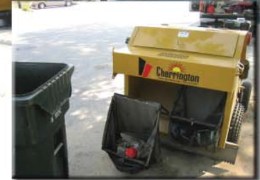
Optional bag system for Models 800 and 950

Beach patrons have high expectations for small beaches and play areas.