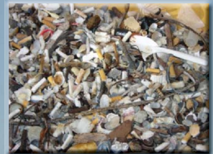
Variety of trash removed