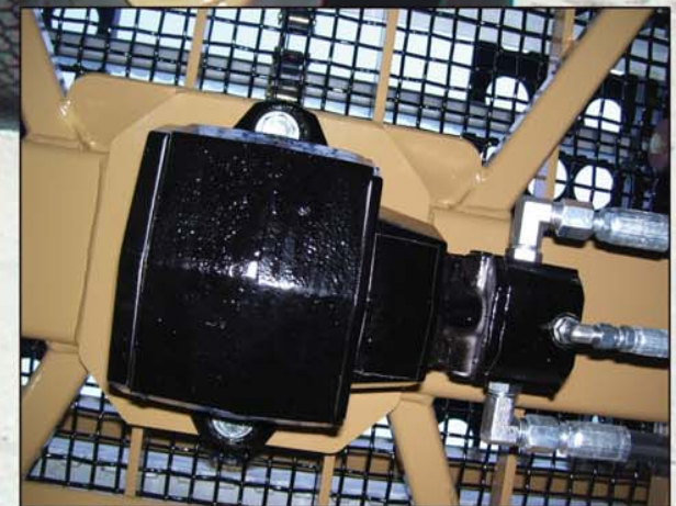
Hydraulic elliptical motor