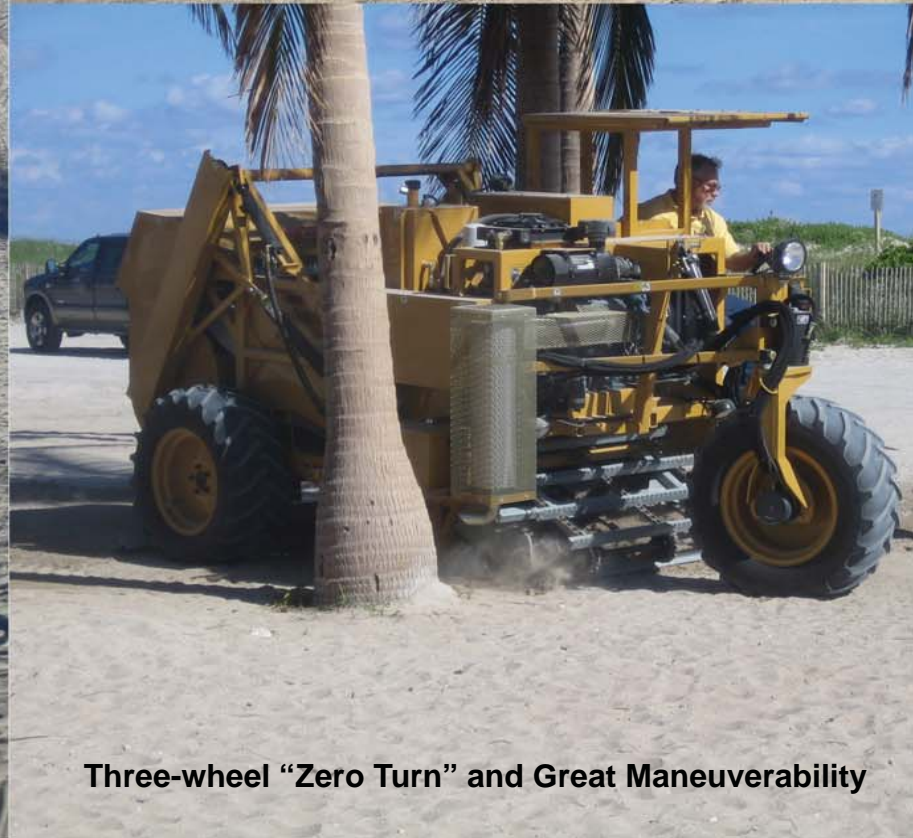
Three-wheel "Zero Turn" and Great Maneuverability