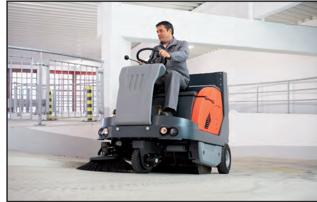
Great for use in indoor or outdoor applications because of the option to choose gas, diesel or battery operated.

Once the 34 gallon dirt hopper is full, the 60" high-dump hopper makes for easy emptying into larger containers. The hopper can be used to the full capacity because of the lifting power of the high-dump hopper.