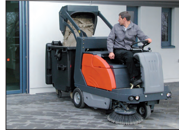
The high dump hopper can be easily emptied into large containers.