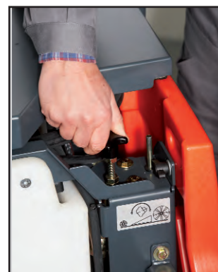
The control for the large dirt flap allows the operator to pick up large items during the course of sweeping.