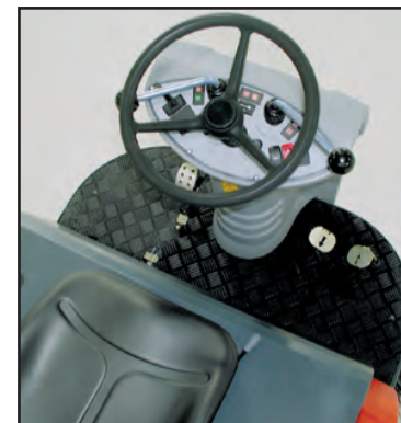
The simple design of the operator controls means less operator error.