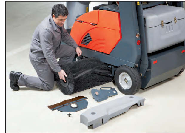
Change-out of main sweeping brush requires no tools and is quick and simple.