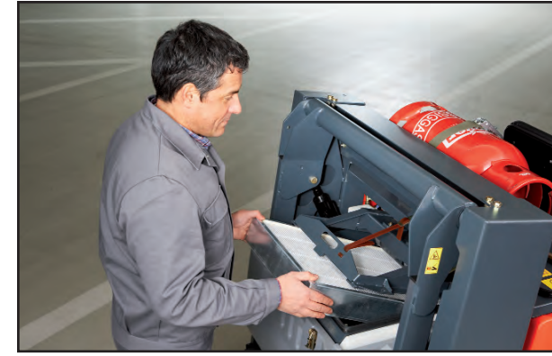
Easily accessible high performance filter system ensures clean exhaust air.