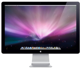
Mac 24" or 27" Monitor