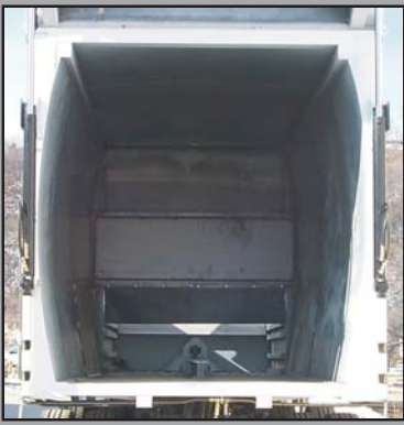
The KANN SL has a smooth contoured body engineered to dump refuse easily and completely clean.