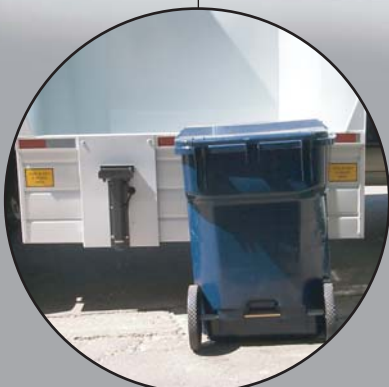
Low 35 inch Loading Height and Up To 2 Cart Tippers

KANN Manufacturing Corporation 210 Regent Street PO Box 400 Guttenberg IA 52052 0400 Tel (563) 252 2035 Fax (563) 252 3069 E-mail sales@kannmfg.com Web www.kannmfg.com