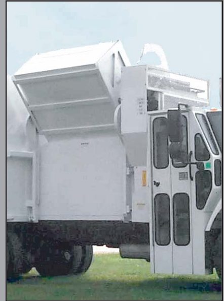
The large 1.8 YD 3 loading trough capacity and the capability to have up to 2 cart tipper mounted on the trough provides for complete versatility of bag, bulk, and cart routes.