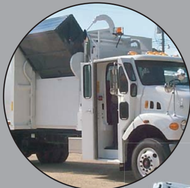
Load With Blade In Any Position and Pack-on-the-Go