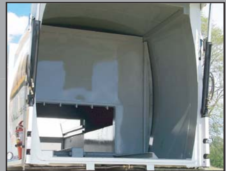
The full eject push out panel quickly travels the full length of the body and is engineered to eject all types of refuse and recyclables easily and completely clean.