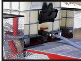
Direct Tank Hook-Up to Nozzle