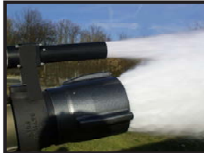
Optional Dual Agent (Foam-Dry Chemical Nozzle)