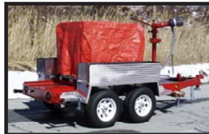
Constructed of bright aluminum tread plate