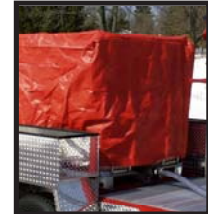
Optional Vinyl Cover