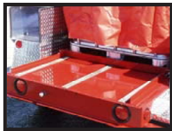
Stainless steel rub rails and quick action clamp