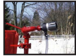
500, 750 or 1000 gpm Gladiator nozzle for Class A or B foam