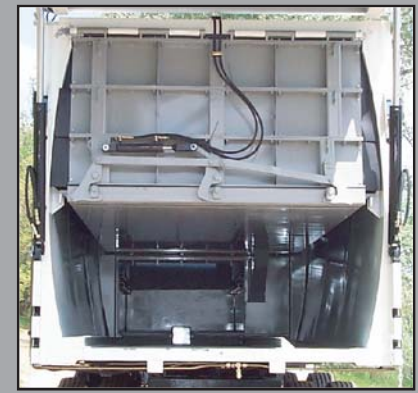
Easily removable bulkhead panels allow for compartment volume to be adjusted 50/50, 60/40, or 70/30. Each compartment has a full eject push out panel that quickly ejects all types of refuse and recyclables easily and completely clean.