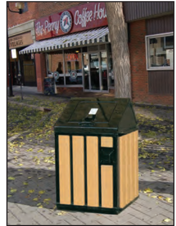
Aesthetically pleasing for feature developments.

Optional concrete pad with proven anchoring system.