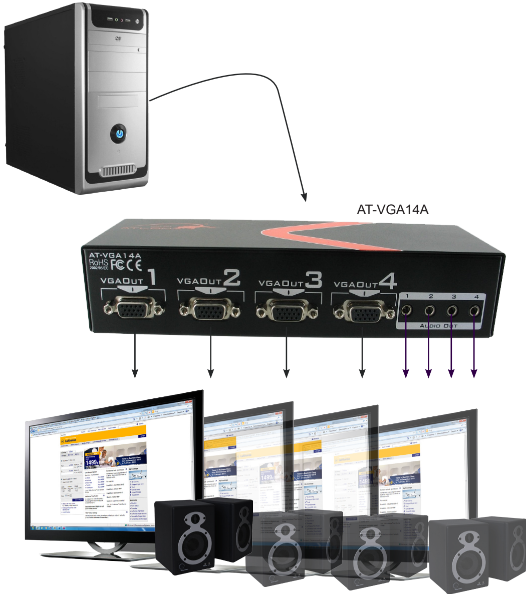
up to 4 LCD monitors and speakers