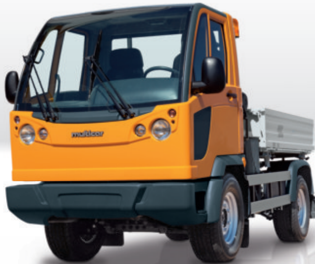
The M 27 B as a three-way tipper

Multicar provides three basic models of the M 27, each one perfectly designed to fulfil your demands and which you can upgrade individually to adapt it to your specific purposes.