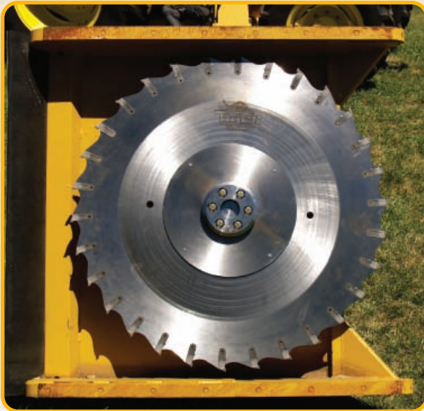
48" Saw Blade Attachment with reinforced center for added blade strength. Tiger Bengal Series 50" Rotary Mower (shown).