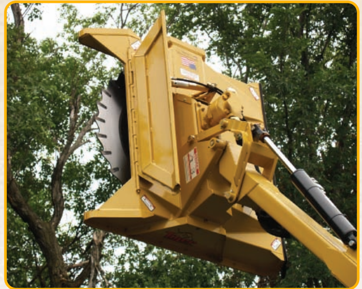
Cuts up to 6" tree limbs with Bengal Series and 8" tree limbs with Saber Series.