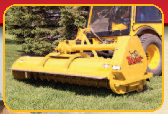
SUPER DUTY FRONT FLAIL

Whether you are mowing thick grass, brush or weeds along the roadside, or leaving a finished cut at the ball fields Tiger has the Flail mowing system for your application.