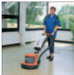
Hako-Super 43/450 High-speed machine for high mirror polishing and cleaning. Construction as Hako-Super 43/180. Typical field of use: polishing of soft floors.