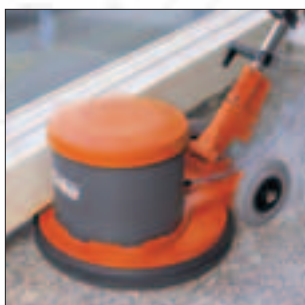
The flat and protruding brush head allows access even below radiators etc.