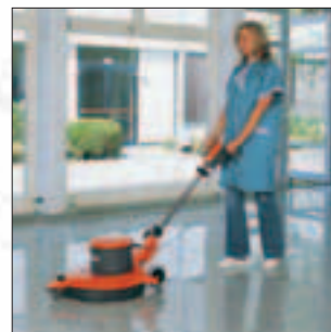
Hako-Super 53/1100 High-speed machine for polishing, cleaning and spraying. Higher productivity by Powerflow system. Typical field of use: polishing all modern types of hard floors.