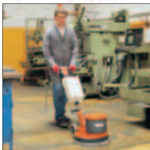
Hako-Super 43/180 Standard machine for basic and maintenance cleaning. Typical field of use: shampooing carpeted areas and basic cleaning of all types of hard floors.