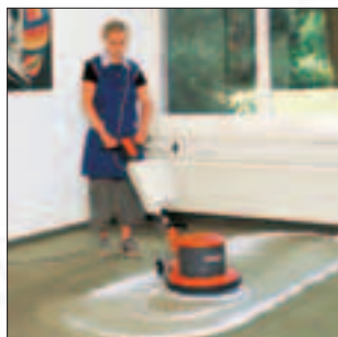
Hako-Super 43/2-speed Universal single-disc machine for scrubbing and polishing, 2 speeds adjustable. Typical field of use: scrubbing and polishing with one single machine.