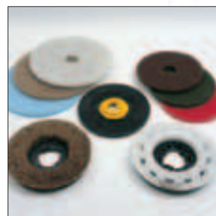
Extensive: A wide variety of brushes, pads and drive plates available for all kinds of use.