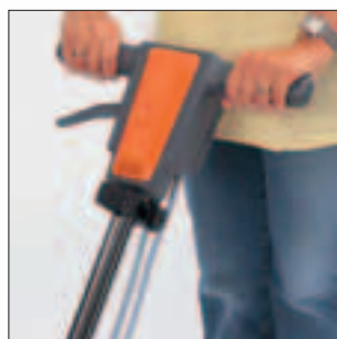
Ergonomic: continuous adjustment of draw- or handlebar allows perfect height adjustment.