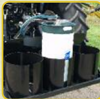
Aquimix (Ready to Use) System attached to the tractor's 3PT.