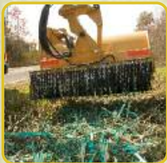
Spray Chamber attaches to Flail or Rotary Cutter Head.