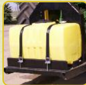
50, 100 & 150 gallon Tank mix systems are available for the tractor 3 PT hitch.

With a single flip of a switch, the WetCut Computer controlled system accurately applies the target rate. The digital display keeps the operator informed on the vehicle speed, system pressure and the GPA (gallons per acre) being applied.