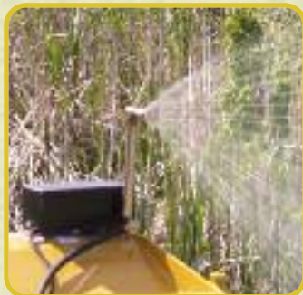
Offset Sprayer can reach weeds up to 14 feet from the right of the mower deck.