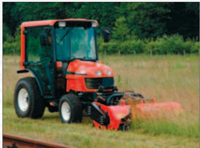
Hakotrac 3100 DA with front-mounted rotary mower 1.50 m width. A high performance for economic mowing of large external grounds. Optionally with various grass collection systems up to 1600 ltr. capacity.