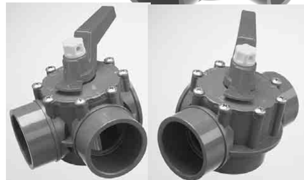
90° MODEL - 2 PORT 0V2-2090