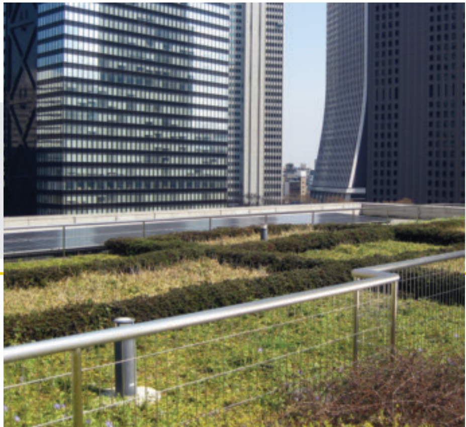
FIG. # 5906, 5907