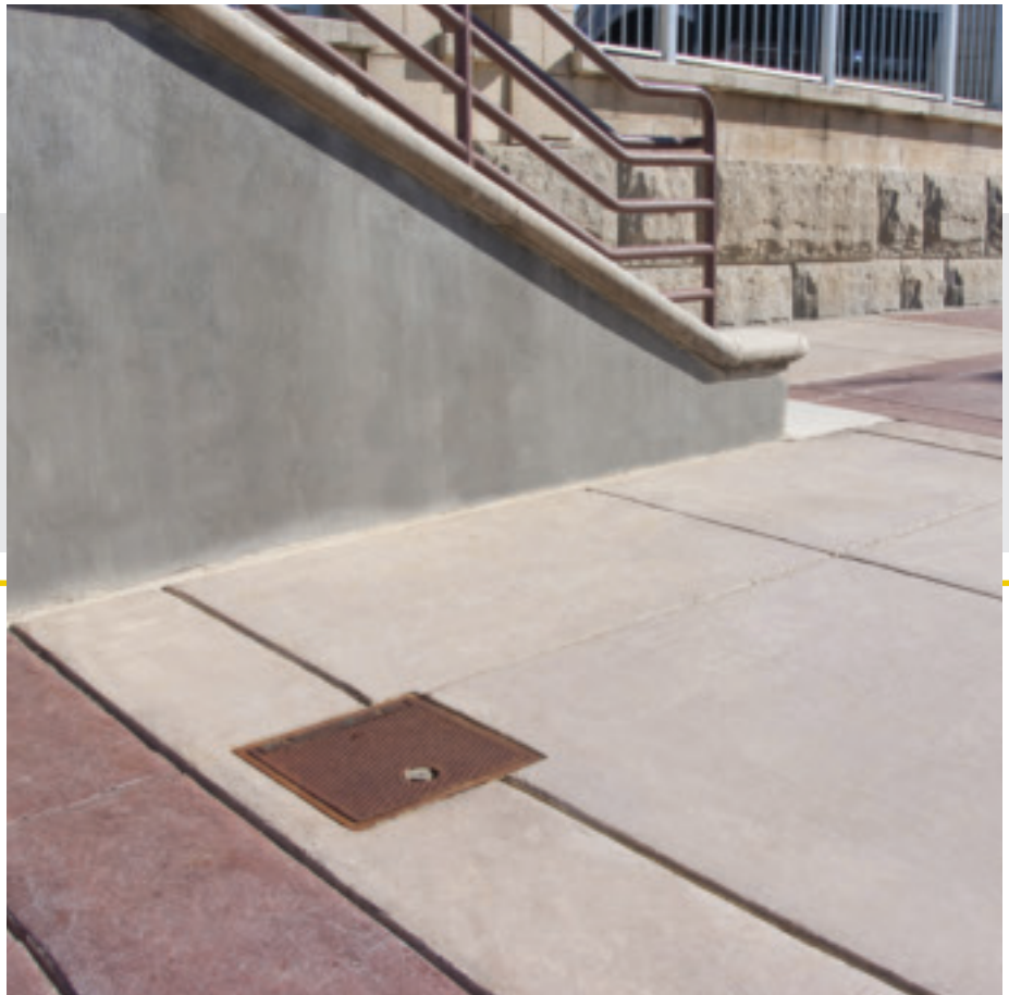
FIG. # 5950 AND 5951