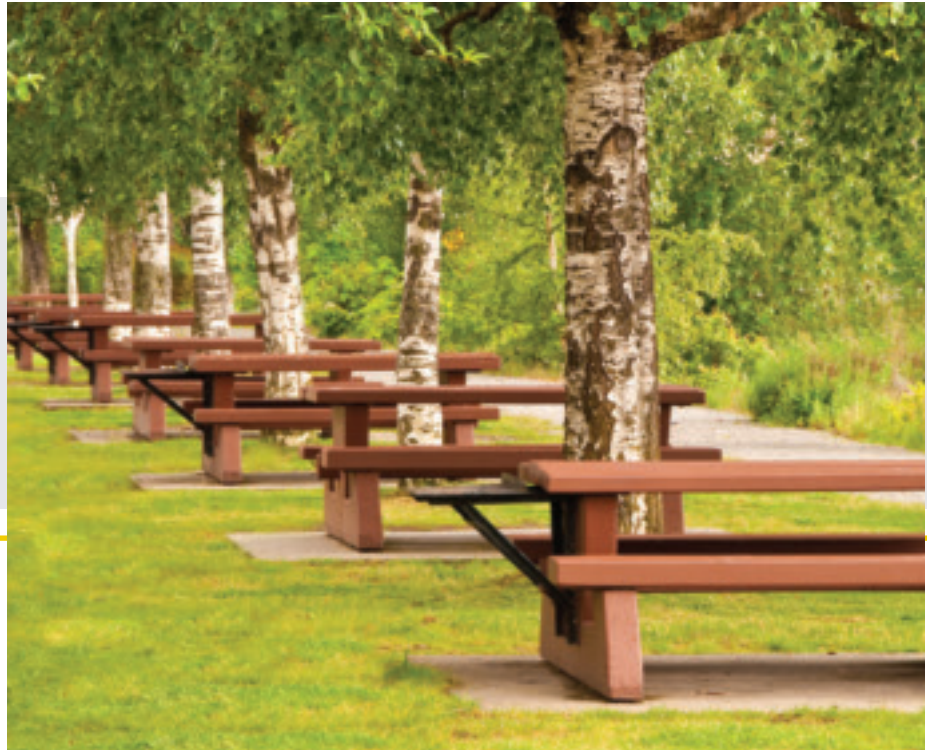
FIG. # 5960, 5961

Compression-Type Non-Freeze Post Hydrant with Wheel Handle