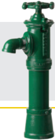
FIG. # 5963

Compression-Type Post Hydrant with Wheel Handle