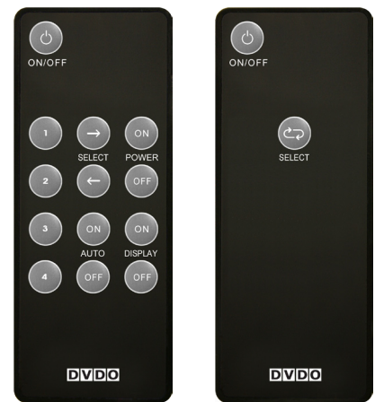
Infrared Remote Control with Discrete codes (Pro and Consumer Models)