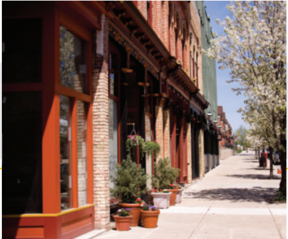
Fig. # 5830, 5831

Flush Box Hydrant with Vacuum Breaker Locking Street Washer