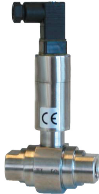
Shown with optional Mini-DIN connector