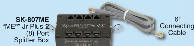
SK-807ME "ME®" Jr Plus 2 (8) Port Splitter Box 6' Connecting Cable