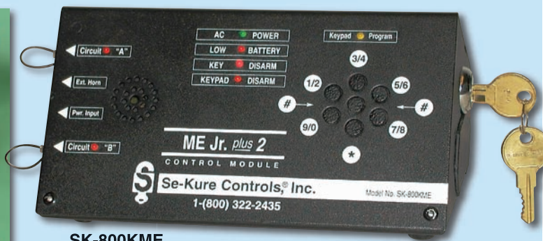
SK-800KME "ME®" Jr Plus 2 Keypad Alarm Module