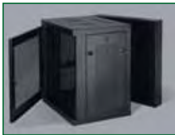
Wall-Mount Enclosure with Hinged Wall Bracket

Most Enclosures include a sturdy hinge between the cabinet and the wall bracket, allowing the cabinet to swing away from the wall for easy access to equipment and cabling.* Top and bottom panels include channels for cable routing. The front door and side panels are removable.