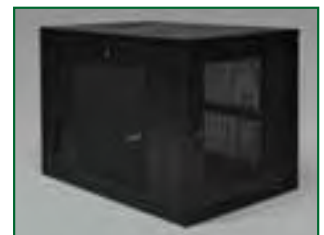
Deep Wall-Mount Rack Enclosure

The Deep Wall-Mount Rack Enclosure (SRW12US33) provides extra mounting depth for deeper equipment cabinets. It's sized to fit standard 1U servers with ample room for cable management and unobstructed airflow.