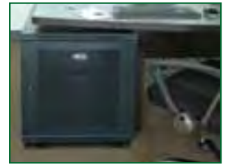
Wall-Mount Enclosure with Rolling Casters

Wall-Mount Rack Enclosures are available in a variety of sizes from 6U to 26U. The optional Rolling Caster Kit (SRCASTER) adapts Enclosures to floor-standing applications, allowing them to roll under desks, tables or counters.