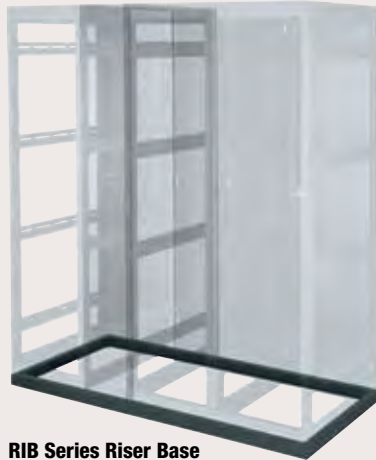
RIB Series Riser Base shown with MRK racks and custom cable chase

accommodates DRK, MRK, VMRK, VRK, WMRK, and WRK Series racks and enclosures