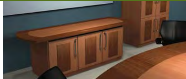
Using the New C5 Millwork Kit lets a custom millworker provide matching outer surfaces. (Not a standard offering)