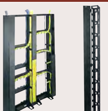
Plastic Vertical Cable Ducts