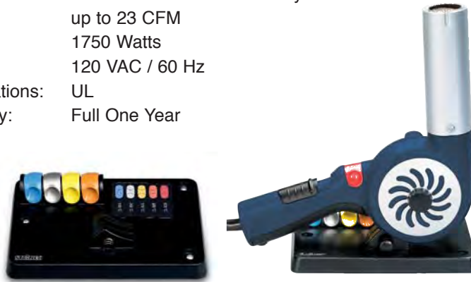
Adjustable quick-lock stand included with HB1750

Temperature: 200 - 1200°F with all five keys Airflow: up to 23 CFM Output: 1750 Watts Voltage: 120 VAC / 60 Hz Certifications: UL Warranty: Full One Year