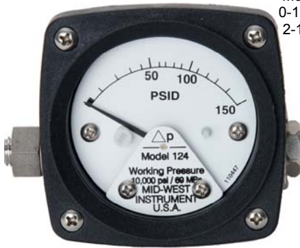
Model 124 0-150 PSID 2-1/2" Dial

A low cost differential pressure gauge for use in measuring the pressure drop across filters, strainers, separators, valves, pumps, chillers, etc., and for local flow indication and control.