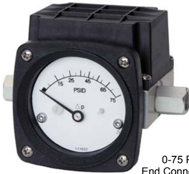
Model 124 0-75 PSID Shown with End Connections & Transmitter

Due to precision sizing of piston and body bore, leakage across piston will not exceed 15 SCFH air at 100 PSID at ambient temperature.