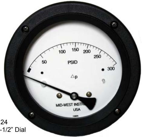
Model 124 0-300 PSID 4-1/2" Dial

An optional maximum indication follower pointer provides automatic indication of maximum differential occurring during a time period or system cycle. Reversed pressure ports are optionally available to facilitate installation and readability depending on which side of a filter, etc., the instrument must be installed.