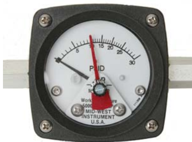
Model 122 0-30 PSID 2-1/2" Dial w/Maximum Follower Pointer

Due to precision sizing of piston and body bore, leakage across piston will not exceed 15 SCFH air at 100 PSID at ambient temperature.