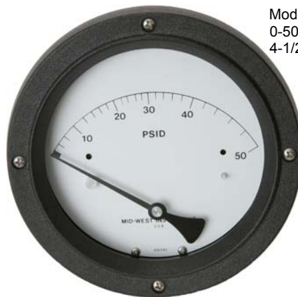
Model 122 0-50 PSID 4-1/2" Dial