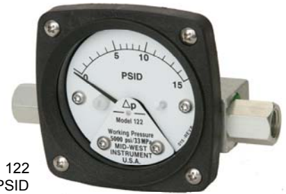
Model 122 0-15 PSID

An optional maximum indication follower pointer provides automatic indication of maximum differential occurring during a time period or system cycle. Reversed pressure ports are optionally available to facilitate installation and readability depending on which side of a filter, etc., the instrument must be installed.