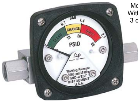
Model 122 With Special 3 color dial

A low cost differential pressure gauge for use in measuring the pressure drop across filters, strainers, separators, valves, pumps, chillers, etc., and for local flow indication and control.