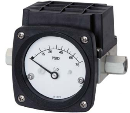
Model 121 0-75 PSID 2-1/2” Dial. Shown with End Connections & Transmitter

Transmitter now CSA Listed for Division 2 Hazardous Location Service