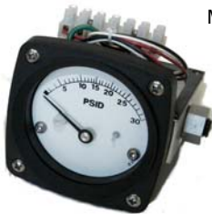
Model 121 Switch ¼” FNPT back connections