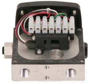
Open back view Model 121 reed switch with terminal strip