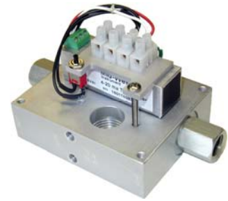
Open view Model 121 Transmitter 4-20 mA terminal strip w/ 1/4" FNPT end connections

Piston-Type Differential Pressure Gauges are available with one or two hermetically sealed reed switches. The switches are adjustable within a defined percentage of the full scale range of the gauge and are available in SPDT and SPST, normally open or normally closed configurations for various load/power ratings. The switches can be set to activate or deactivate on rising or falling pressure. Switches are "CE" marked per the EU low voltage directive. Models 121 can be configured for use in Hazardous Locations.