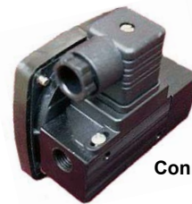
DIN Connector Shown

NOTE: Reverse pressure should be avoided.