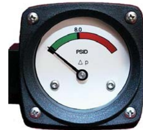
Shown with special option color dial

NOTE: Reverse pressure should be avoided.