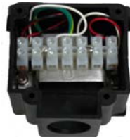
Model 142 shown with “BA” switch option

(2) Reed switches located inside NEMA 4x enclosure with 7 position terminal strip. An opening at rear of enclosure accepts ½” flexible weather-proof or conduit connector (supplied by customer).