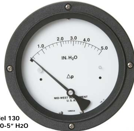
Model 130 Range 0-5" H2O

When it comes to tough application solutions Mid-West Instrument provides the answer!!