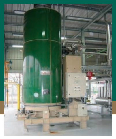
Merck depends on Clayton E-604 units.