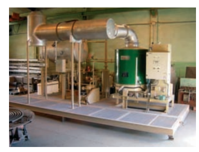
Schering-Plough has relied on Clayton for 35 years.