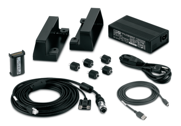
RD5000 Mobile RFID Reader accessories

For more information on how the RD5000 can enrich your RFID system, contact us at +1.800.722.6234 or +1.631.738.2400, or visit us on the Web at www.symbol.com/RD5000