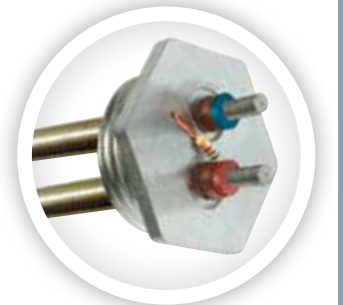
Patented Lifeguard™ Elements are durable for high performance