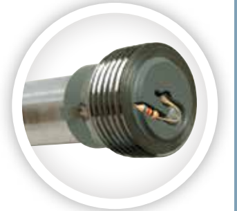
Patented R-Tech Anode Rods prolong the life of the water heater