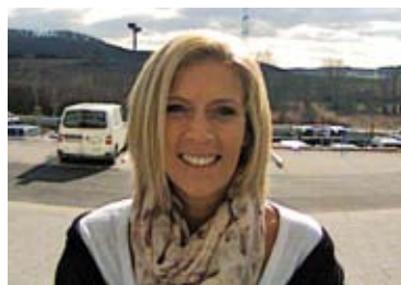
vPTZ in the center of the live image