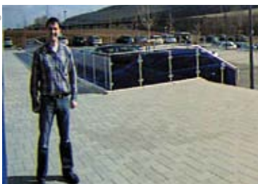
vPTZ in the left of the live image

The image is panned and zoomed electronically without any mechanical movement, meaning that there is no wear and tear to the camera and no maintenance is required. In addition, the MOBOTIX system allows users to return to the recording at a later time and view the entire entrance area , even if the video at the time of the actual recording was focused on the visitor's face.