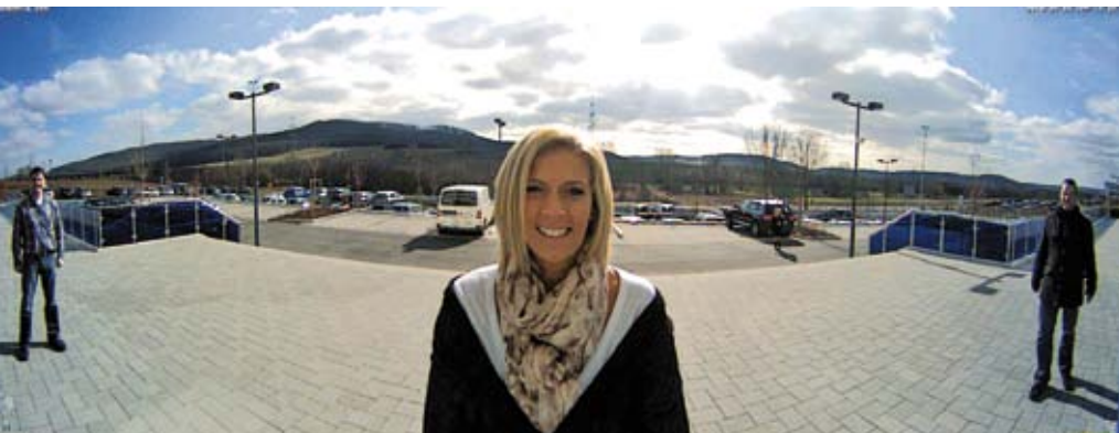
Original HiRes panorama image