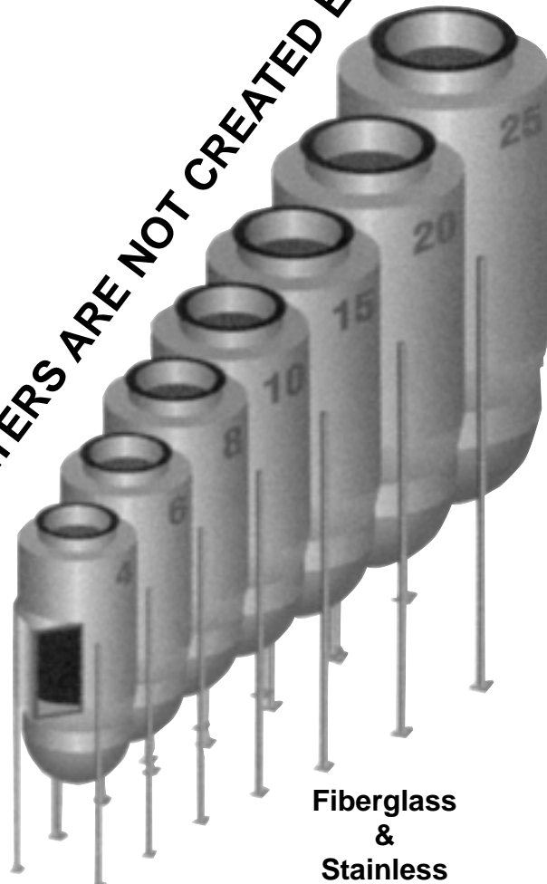
Fiberglass & Stainless