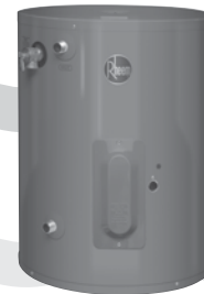
6, 10, 15, 20 and 30-Gallon