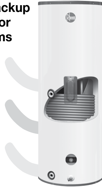
Solaraide HE Tanks 80- and 120-Gallon Capacities Heat Exchanger Electric WHs and Storage Tanks

Units meet or exceed ANSI requirements and have been tested according to D.O.E. procedures. Units meet or exceed the energy efficiency requirements of NAECA, ASHRAE standard 90, ICC Code and all state energy efficiency performance criteria.