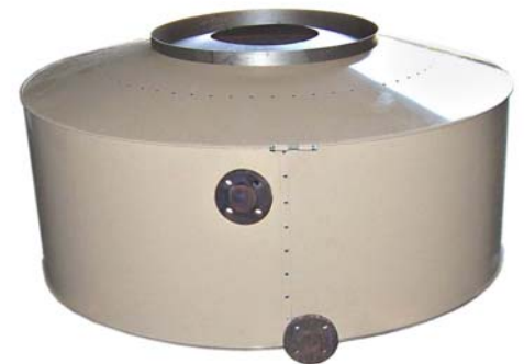
SE Section with outer shells

On a Steam Generator, the SE section is mounted on top of the main heating coil and adds approximately 15" to 36" to the overall height, depending on the model selected. No special supports are required as the weight of the SE section is supported by the main heating coil. SE sections are factory mounted and tested with the unit. Depending upon height restrictions for shipment, the SE section can be removed for shipment and reinstalled on site by the installing contractor.