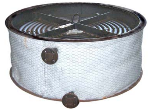
SE Section without outer shells

The Clayton Super Economizer (SE) coil assemblies are constructed in a similar fashion to the main heating coil section. The typical SE coil assembly has six (6) coils enclosed in a carbon steel jacket surrounded by insulation and a sheet metal outer shell. Each coil is a spirally wound, tube section constructed of SA178 carbon steel tubing. The assembly is welded with clips and spacers in a monotube coil design to optimize heat transfer between combustion gas and water flow. Water flow in the SE section is counter to the exhaust gas flow, with the feedwater entering at the top and exiting at the bottom. Exhaust gases flow from the bottom to the top.