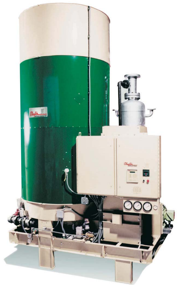
Steam Generator Model SE with Super Economizer Installed