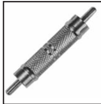
35-548 RCA-type pin plug adapter. Male to Male RCA plugs. Gold.