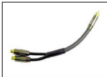
35-525-HG Shielded 8mm High Grade OFC "Y" cables with high quality gold plated connectors. RCA Male to dual RCA Females. 6" long.