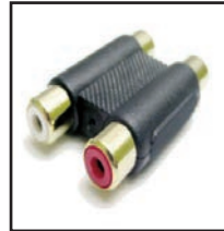
35-569 Dual Female RCA barrel jack. Gold plated.