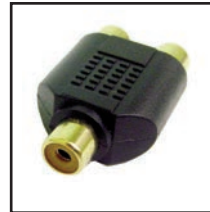
35-505 Nickel 35-505G Gold Shielded "Y", one RCA Female jack to two RCA Female jacks.