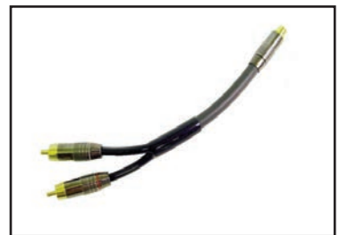
35-530-HG Shielded 8mm High Grade OFC "Y" cables with high quality gold plated connectors. RCA Female to dual RCA Males. 6" long.