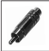
35-539 Nickel 35-539-P Plastic 3.5 mm mono jack to RCA-type pin plug. Shielded. Nickel plated.