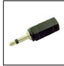
35-552 3.5 mm mono plug to 3.5 mm stereo mini jack.