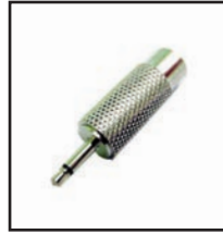
35-583 2.5 mm mono plug to RCA jack.