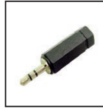
35-565 3.5 mm mono jack to 3.5 mm stereo plug.