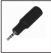
35-518 Plastic 35-518-M Nickel 3.5 mm stereo jack to 2.5 mm stereo plug adapter.