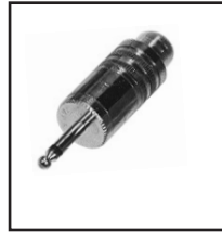
35-540 3.5 mm mono jack to 2.5 mm mono plug. Shielded. Nickel plated.