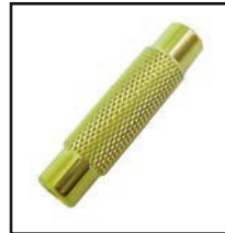
35-546G Gold, 35-546-NK Nickel, 35-545 Female to Female RCA coupler. Nickel, plastic barrel.