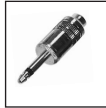
35-541 2.5 mm mono jack to 3.5 mm mono plug. Shielded. Nickel plated.