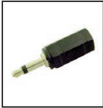
35-552A 3.5 mm mono plug to 3.5 mm stereo mini jack.