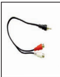
35-525 RCA plug to two RCA-type pin jacks, shielded. 10" long.