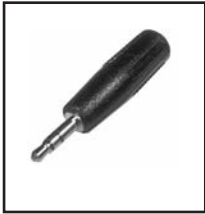
35-582 Plastic 35-582-NK Nickel 2.5mm stereo jack to a 3.5mm stereo plug.