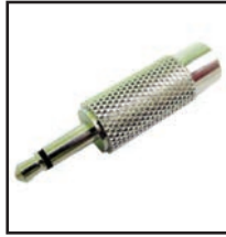
35-538 Nickel 35-538-P Plastic RCA-type pin jack to miniature 3.5 mm mono plug. Nickel plated, shielded.