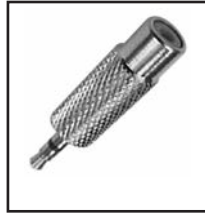
35-512 3.5 mm stereo plug to RCA Female jack.