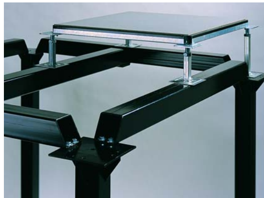
4'x4' Understructure with steel access floor panel

The Perfect Solution for Creating Large Underfloor Spaces for Piping, Ventilation and Electrical Requirements