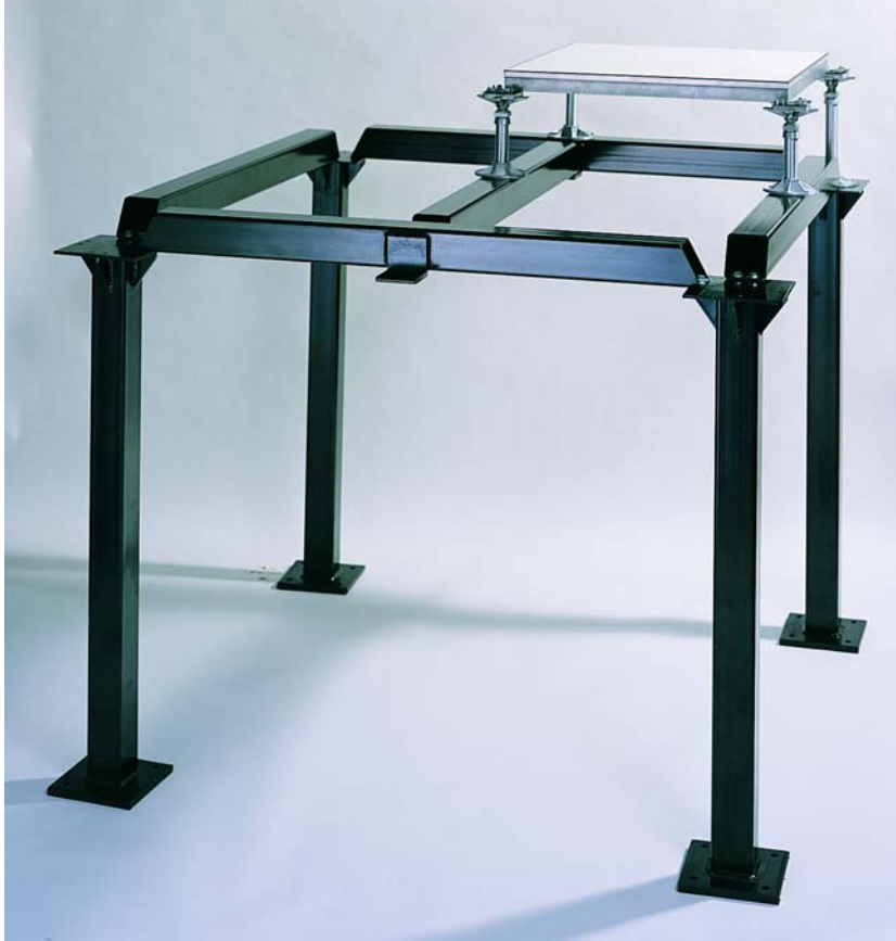
4'x4' Understructure with aluminum access floor panel.

The Perfect Solution for Creating Large Underfloor Spaces for Piping, Ventilation and Electrical Requirements