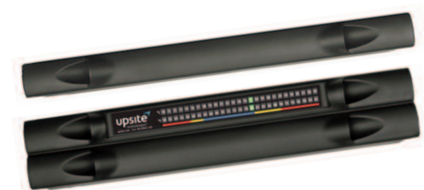
HotLok Snap-In Blanking Panels