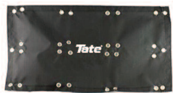
In-Floor Velocity Adjustor

The Velocity Adjustor is made of Sandel “The fire fighting fabric”. This completely non-flammable cover ensures that the Velocity Adjustor is completely safe to use in a supply plenum and comes in three sizes that accommodate most common subfloor height.