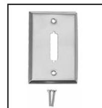
30-599 25 pin "D" cutout single gang stainless steel wall plate with hardware. For Male or Female connectors. Works with Calrad part numbers 30-575, 30-577.