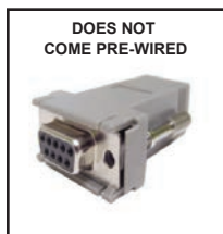
DOES NOT COME PRE-WIRED 30-592-6 .... RJ12 30-592-8 .....RJ45 30-592-8-BK 30-592-8M 30-592-8M-BK RJ45 Female DB-9, D-Sub to either RJ-12 or RJ-45 jacks. grey or black plastic hood with long thumb screws. 30-592-8M has a metal hood.