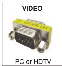
VIDEO 30-588 30-588G Gold 15-pin Male to Male gender changer. High density "D" connector plugs for inline or panel mounting.