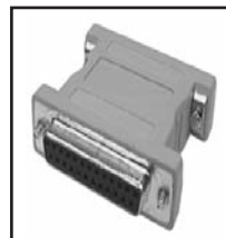
30-579 25-pin Female socket to 25-pin Female socket modem adapter.