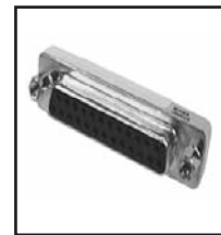
30-575 25-way "D" connector plug to 25-way "D" connector plug mini version.