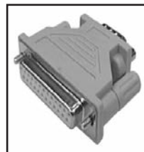
30-586 25-pin Female socket to 9-pin Male plug.