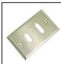
30-574 HDDB 15 pin VGA cutout and DVI cutout on a single gang stainless steel wall plate with hardware. For Male or Female connectors. Works with Calrad part numbers 30-580, 30-582, 30-587, 30-588 and 35-710A.