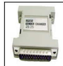
30-576 25-way "D" Male plug to 25-way "D" Male plug. 30-578 Female to Female