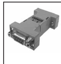
30-581 Male 9-pin "D" connector plug to 9-pin "D" connector plug. 30-583 Female 9-pin "D" connector socket to 9-pin "D" connector socket.