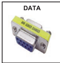
DATA 30-582 DB9 Female to DB 9 Female gender changer mini version. 30-582-MF DB9 Male to DB 9 Female gender change