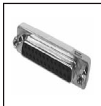
30-577 25-way "D" connector socket to 25-way "D" connector socket mini version.