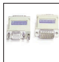
30-594 10 position 30-593 6 position VGA to MAC adapter, 10 position or 6 position Dip Switch For connecting Apple DB15 pin to HDDB 15 pin. Supports Apple standard display modes. Dip switches select different display modes.