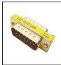
30-584-M 15 pin gender changer. Male-Male.