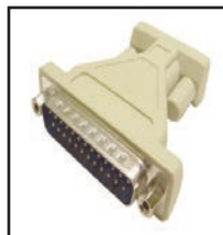
30-585 25-pin Male plug to 9-pin "D" Female socket.