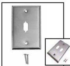
30-597 Single Cutout 30-597-2 Dual Cutout 15 pin high density "D" cutout single or dual gang stainless steel wall plate with hardware. For Male or Female connectors. Works with Calrad part numbers 30-580, 30-582, 30-587, 30-588.