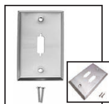
30-598 Single Cutout 30-598-2 Dual Cutout 15 pin wide "D" cutout single or dual gang stainless steel wall plate with hardware. For Male or Female connectors. Works with Calrad part numbers 30-584-M, 30-584-F and 35-710 DVI-I coupler.