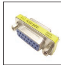
30-584-F 15 pin gender changer. Female-Female.